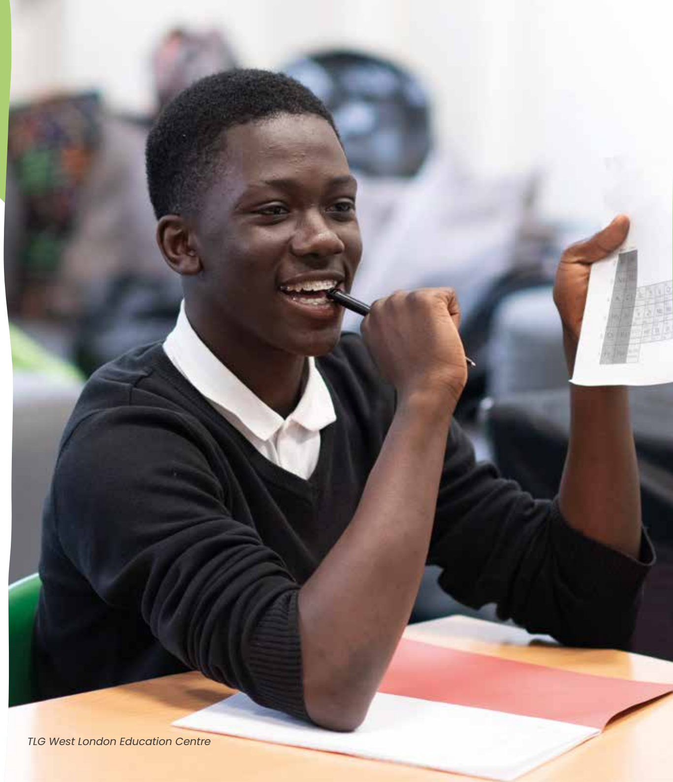
TLG West London Education Centre